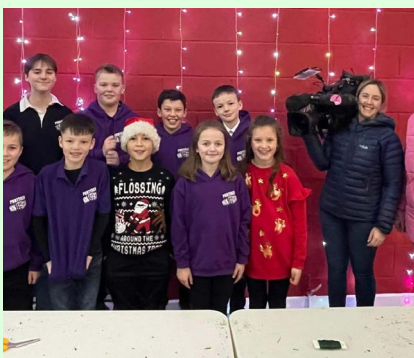
Club of the Year Pontfaen YFC Wales Young Farmers

From an illuminated tractor run raising over £5,000 for charity, to featuring on national news to highlight the importance of young people in rural communities. This club has had an incredibly packed program of activities that has made a profound impact on young people and the local community.