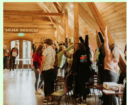
Project of the Year 'Give way to youth' Latvian 4H