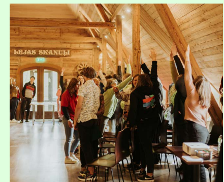
Project of the Year 'Give way to youth' Latvian 4H