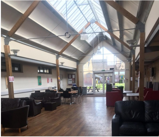
Break Out Area/Café